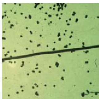
MINUTENESS of powder chips is evident in a micrograph showing a single hair from a Japanese woman surrounded by silicon bits the size of those chips.

of digit combinations. At the same time, the approach would ensure security because the information stored in the read-only memory would be unchangeable. He also stripped out all essentials, leaving behind, aside from the ROM, a simplified radio-frequency circuit (to interact with the antenna), a rectifying circuit (to manage current flow) and a clock circuit (to synchronize the chip's activities and coordinate them with a scanner).