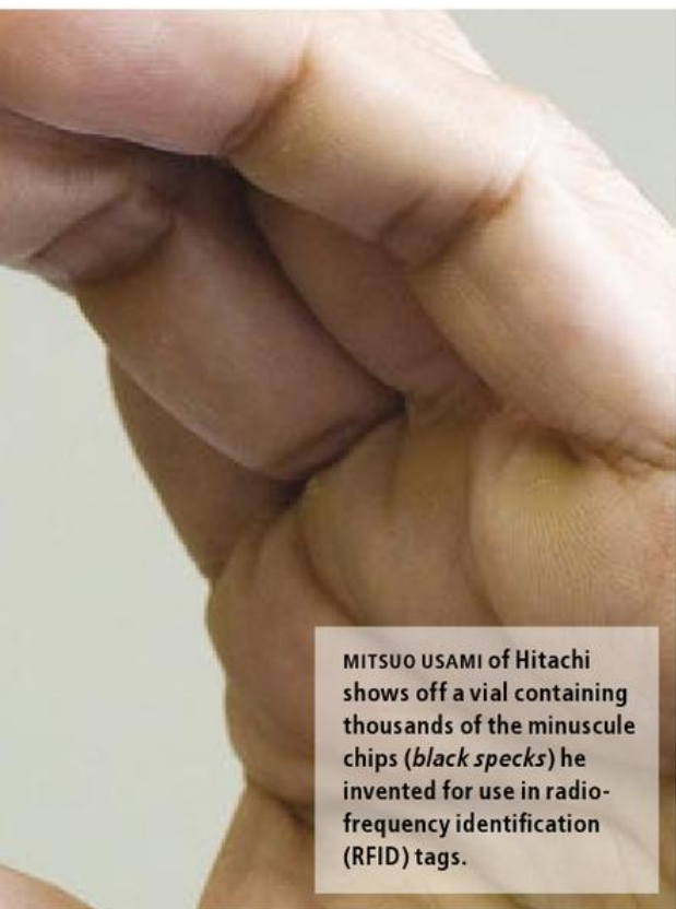
MITSUO USAMI of Hitachi shows off a vial containing thousands of the minuscule chips ( black specks ) he invented for use in radio-frequency identification (RFID) tags.

Radio-frequency identification tags label all kinds of inventoried goods and speed commuters through toll plazas. Now tiny RFID components are being developed with a rather different aim: thwarting counterfeiters By Tim Hornyak